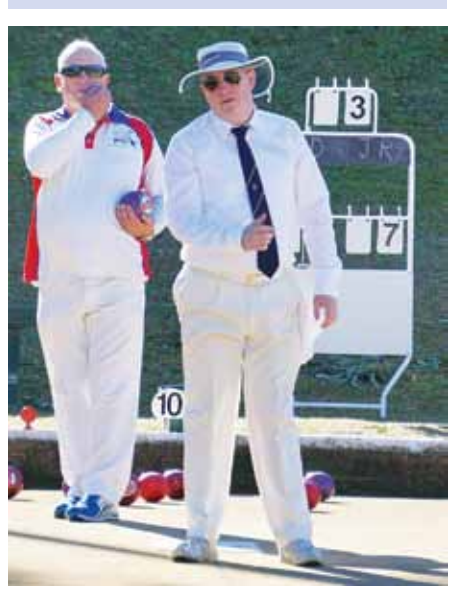
ls it a new uniform or simply sartorial elegance?